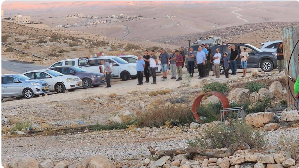
As they left, the settlers cut multiple holes through the village's water pipes. 12/13